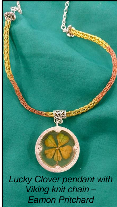
Lucky Clover pendant with Viking knit chain – Eamon Pritchard