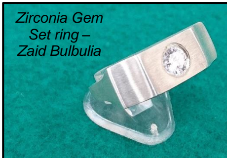
Zirconia Gem Set ring – Zaid Bulbulia