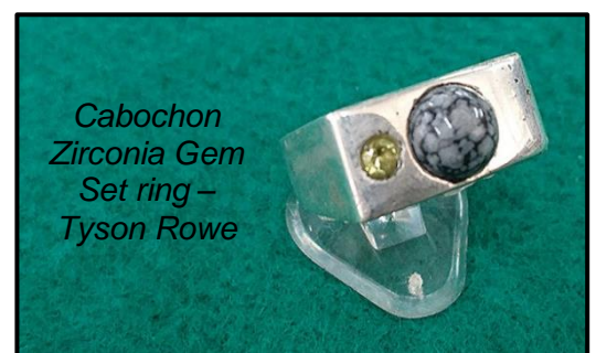
Cabochon Zirconia Gem Set ring – Tyson Rowe