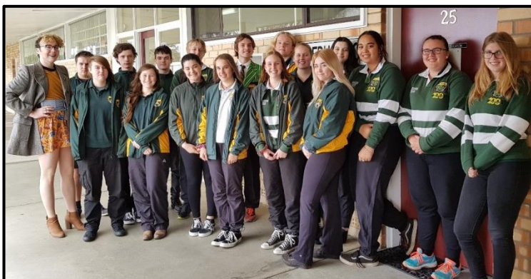
Cert II 2018 Business Management and Enterprise class members

The Year 12s worked individually and in teams to investigate and research public image, business function, marketing, organisational structures, employment, consumer rights, management styles, intellectual property, legislation and the law. They completed an Externally Set Task in Term 2, Week 4 with a high percentage of students achieving success in this task. The students designed and marketed a cereal box and also learnt how to write and develop a professional business plan.