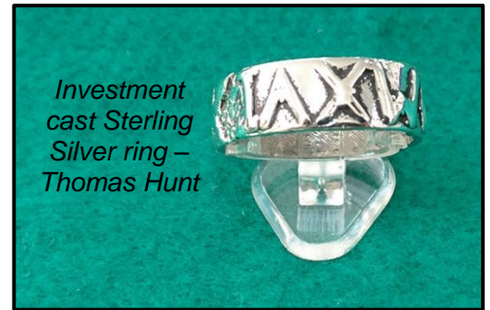
Investment cast Sterling Silver ring – Thomas Hunt